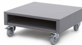
Base cabinet on wheels For mobile use Ident. No. 0020007602