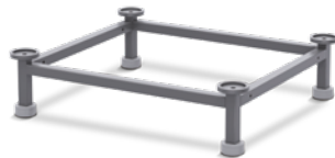
Stacking Frame To stack the ovens Ident. No. 0035001326