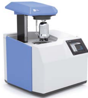
C 6000 Oxygen bomb calorimeter Ident-Nr. 008804300

If required, the following IKA devices are available for your lab to enhance tempering using the Oven 125 basic and control