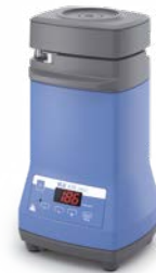
A 10 basic Batch mill Ident-Nr. 0004020700