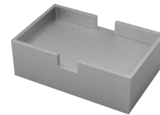
DB 7.1 Double block Suitable for: Microtitre plates