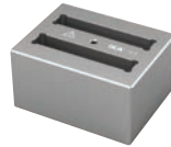
DB 8.1 Single block Suitable for: Cuvettes