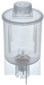
DIS-300-S-M.10 Dissolver tube Volume: up to 300 ml Application: Crushing and dissolution of tablets and dragées. This tube is equipped with a dissolver blade and opens up new application fields. It was especially designed for dissolving samples in different solvents. Ident. No. 0020016318