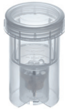
BMT-50-G Tube for grinding with glass balls (10x) Volume: 15 – 50 ml Application: Dry milling of dry and brittle samples (e.g. kaolin, gypsum, coloured pigments, tablets), cell maceration, processing of materials mixed with fluids. Ident. No. 0003699800