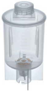
DIS-300-S-M.10 Dissolver tube Volume: up to 300 ml Application: Crushing and dissolution of tablets and dragées. This tube is equipped with a dissolver blade and opens up new application fields. It was especially designed for dissolving samples in different solvents. Ident. No. 0020016318