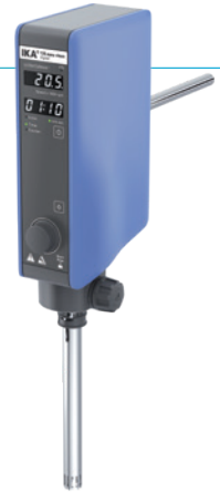
T 25 easy clean digital High-performance disperser Ident. No. 0025002560