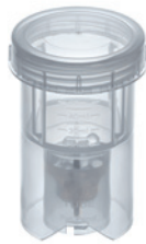
BMT-50-G Tube for grinding with glass balls (10x) Volume: 15 – 50 ml Application: Dry milling of dry and brittle samples (e.g. kaolin, gypsum, coloured pigments, tablets), cell maceration, processing of materials mixed with fluids. Ident. No. 0003699800