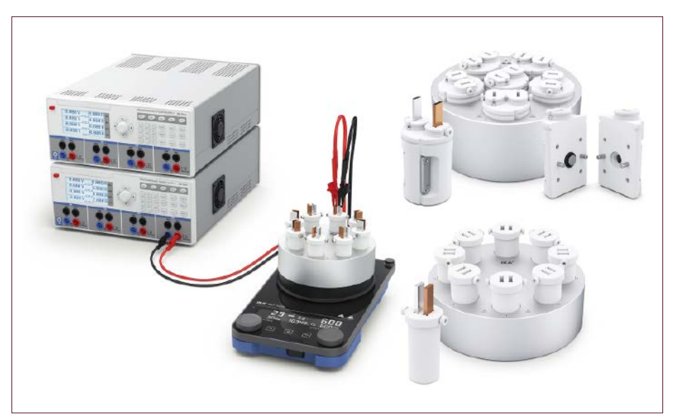
Fig. 2: IKA's commercial screening system. Left: Setup consisting of two multi-channel DC power sources, a hot plate and the reaction block including 8 undivided cells. Top right: Reaction block and single divided electrolytic cell plus two half cells. Bottom right: Reaction block and single undivided electrolytic cell.