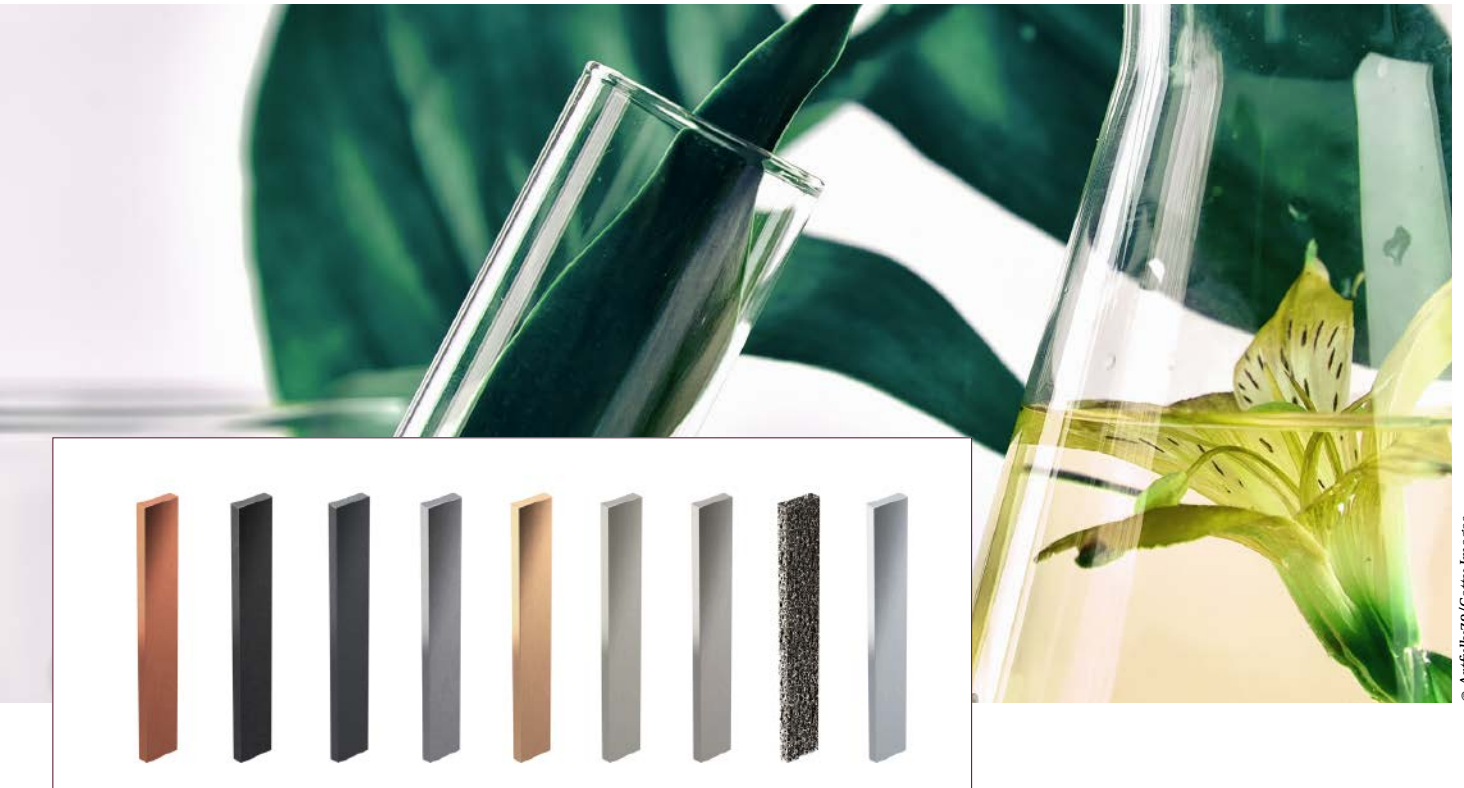
Fig. 3: Electrodes made of different materials for the screening system.

be easily tested here in electrosynthesis, as the electrodes used have simple dimensions of 3 mm x 10 mm x 70 mm.