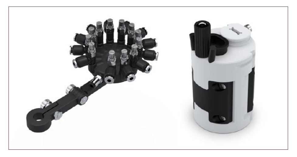
Fig. 4: Accessories for electrolysis with gaseous components. Left: Gas distributor, for dividing a gas stream among the screening cells. Right: Divided screening cell for gas diffusion electrodes.

The speed of establishing electrolysis achieved by parallelization and the small screening scale enables the combination of modern exploration and optimization methods from fields such as design of experiment or machine learning. This linkage is emerging as an extremely powerful tool in the exploration and optimization of new electroorganic reactions. Especially for reactions where the effects of the reaction parameters on the figure of merit interact with each other, optimization sometimes proves to be very